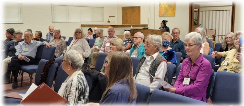
Congregation giving feedback on service