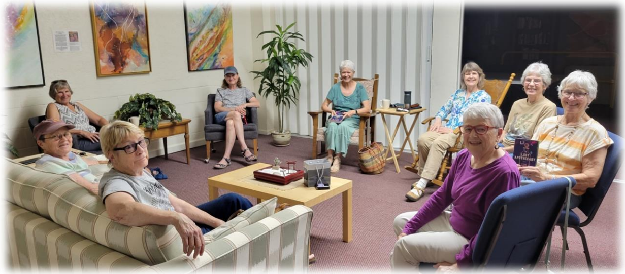
The No Guilt Book Club discussing The Lost Apothecary on June 9 th at the Fellowship House